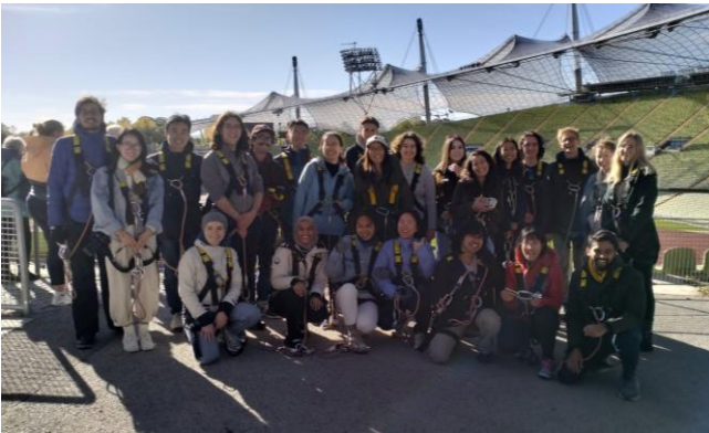
Olympiapark Rooftop Tour